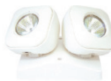
RH16-2 (Double Head)