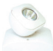
RH16-1 (Single Head)

All dimensions are in inches (millimeters).